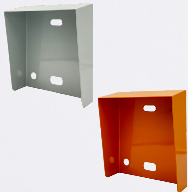
Accessories: Cover for outdoor use