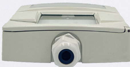
IP54 / IP65